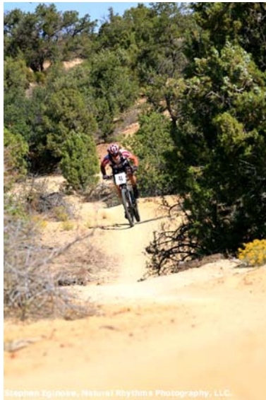
Stephen Equino, Natural Rhythms Photography, LLC