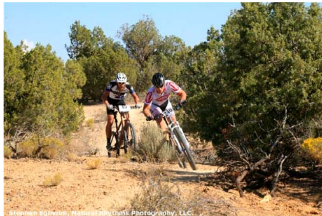
Stephen Egimick, Natural Rhythms Photography, LLC